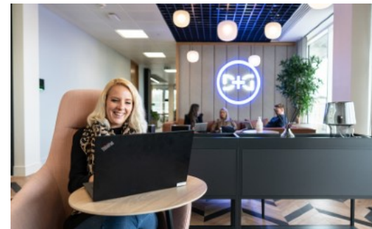
Wellbeing & rewards