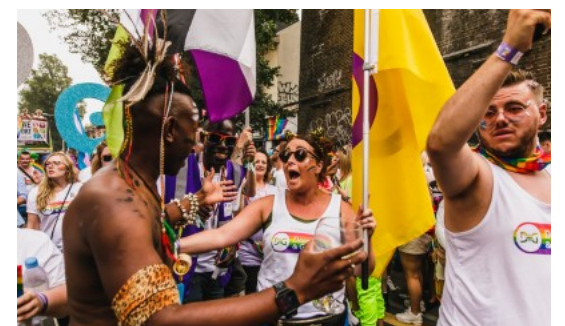
Diversity & inclusion